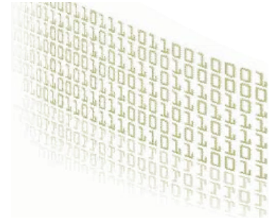
Robotic Process Automation as an accelerator for technological change